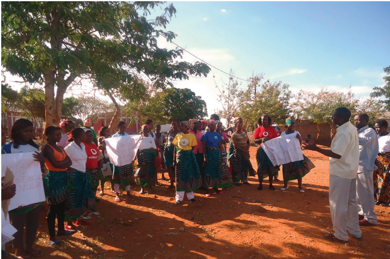
A moment from the campaign against domestic violence lead by Progresso learners

The portable libraries are managed by the literacy facilitator with the support of his/her supervisor.